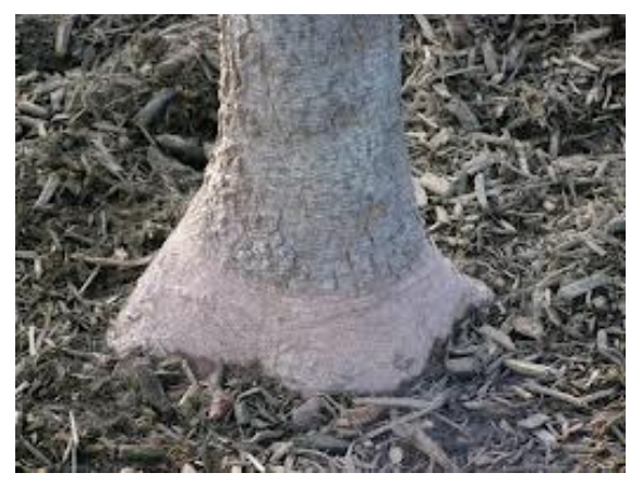
Root flare correctly placed above soil

Set stakes <u>before</u> setting the tree. Set the tree straight & NOT TOO DEEP!! Get Lead Planter's approval before filling hole