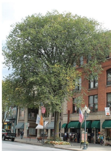
368 B'way (corner, Phila) [DBH=30 inches]