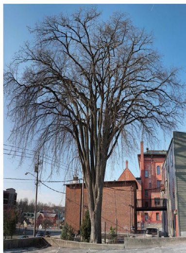
35 Maple Ave (parking lot) [DBH=45 inches]

DBH=Diameter at Breast Height (4'6" high)