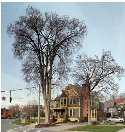
563 No. B'way (at Arterial) [DBH=38 inches]