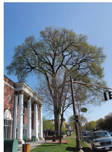
519 B'way (opp. City Center) [DBH=42 inches]