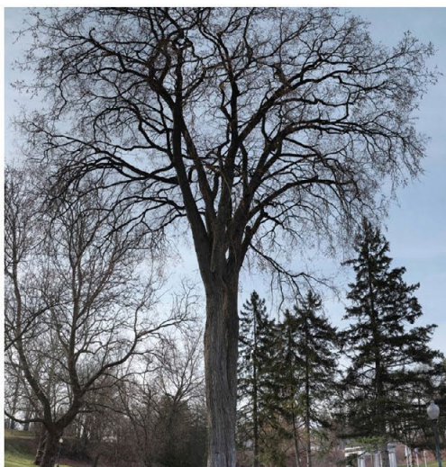
Congress Park (near pond) [DBH=44 inches]