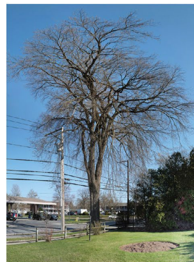
So. B'way (south of Lincoln) [DBH=48 inches]