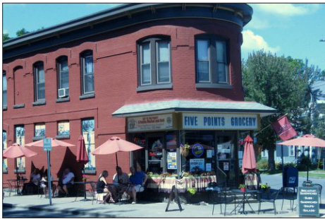
Five Points Grocery - 42 Park Place

Mixed use neighborhoods involve siting small-scale commercial establishments, as well as recreational amenities, close to or within residential neighborhoods. Neighborhood retail shops, restaurants, and recreation afford opportunities for residents to walk, bike, and interact with each other in public space.