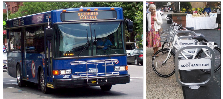
Mass transit, bicycling, and walking should be more convenient.

Land use decisions should help reduce the preeminence of personal automobiles by prioritizing mass transit, pedestrian, bicycle, and handicap-accessible infrastructure in public rights-of-way. Innovative approaches to transportation: